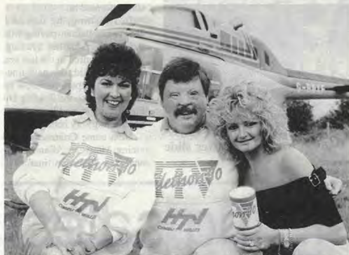
Ruth Madoc (left), Simon Weston and Bonnie Tyler during their flying visit to Rhyl in the Manweb helicopter.