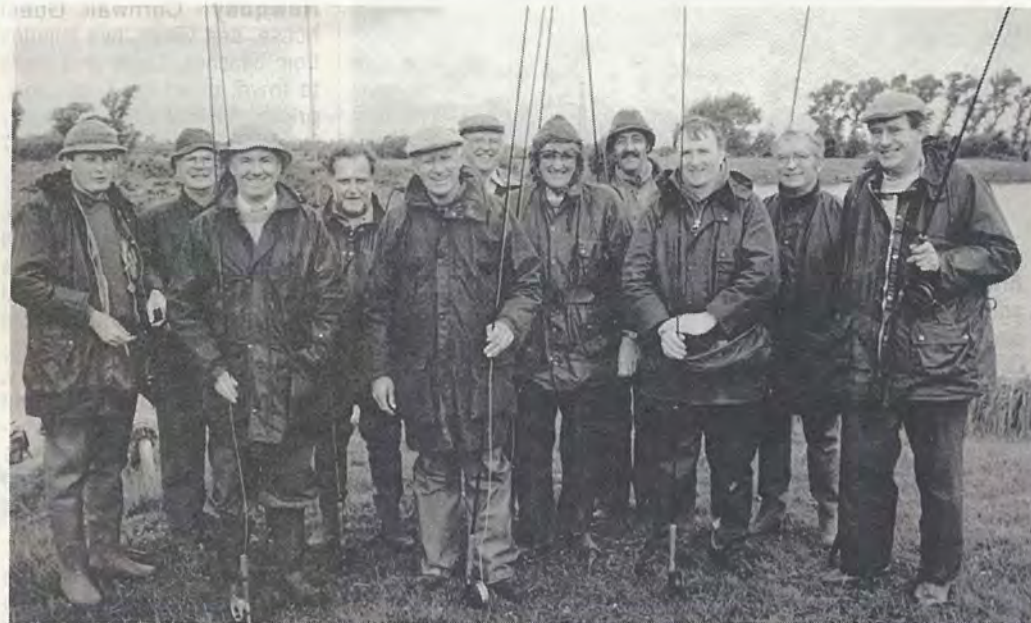
The massed rods of Manweb.